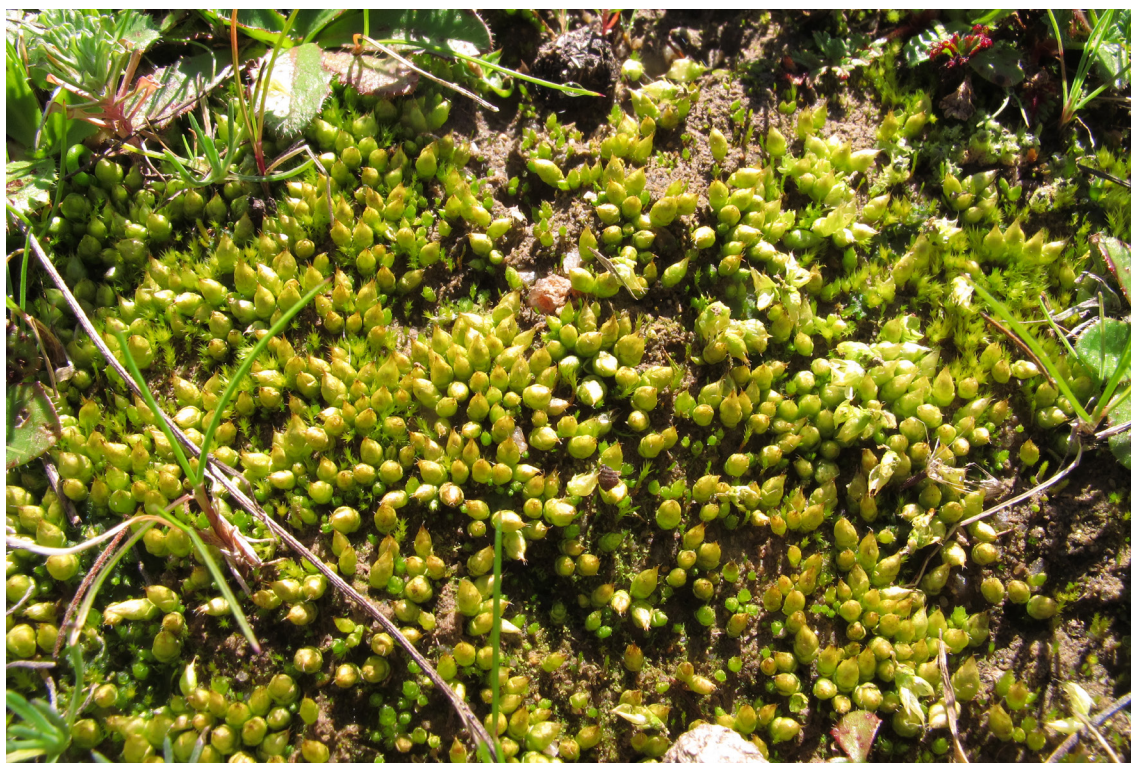
Fig. 1. Field habit of Lorentziella imbricata (Mitt.) Broth., growing on bare soil in Reserva Nacional Lago Peñuelas (Larraín 40356, CONC).

Lorentziella Müll.Hal. ex Besch. Mem. Soc. Sci. Nat. Math. Cherbourg 21: 259. 1877. Type: Lorentziella paraguensis Besch. [Paraguay] Assomption, sur les pelouses. Pl. du Paraguay . - 1874-1877, Juillet 1876, B. Balansa 1258 ( Lectotypus PC0696102! (selected here); Isolectotypi PC0696101!, BM000873341, NY00968181!, G00040419!).