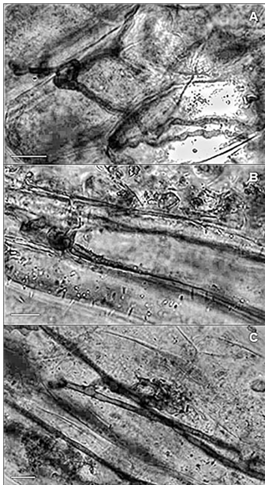
Fig. 2. Examples of gametophytes staining with the new improved protocol for the observation of arbuscular mycorrhizal. A: Anthocerotophyta. B: Bryophyta ( s.s. ). C: Marchantiophyta. Scale bars = 10 µm.

The proposed protocol consists of cleaning the gametophytes with water and fixing them in 70% ethanol. Subsequently, clarify them in two steps: first, using the fixing agent at 50 °C until the total evaporation of the liquid, and rinsing the gametophytes once in water; and second, using 1% KOH (80 °C, 20 min); rinse the gametophytes one time in water. Then acidify with 1% HCl (50 °C, 10 min); rinse the gametophytes once in water. Finally stain with 0.05% trypan blue in aqueous solution (60 °C, 20 min); rinse the gametophytes twice in water.